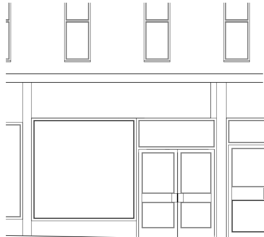
St. John's Street Elevation