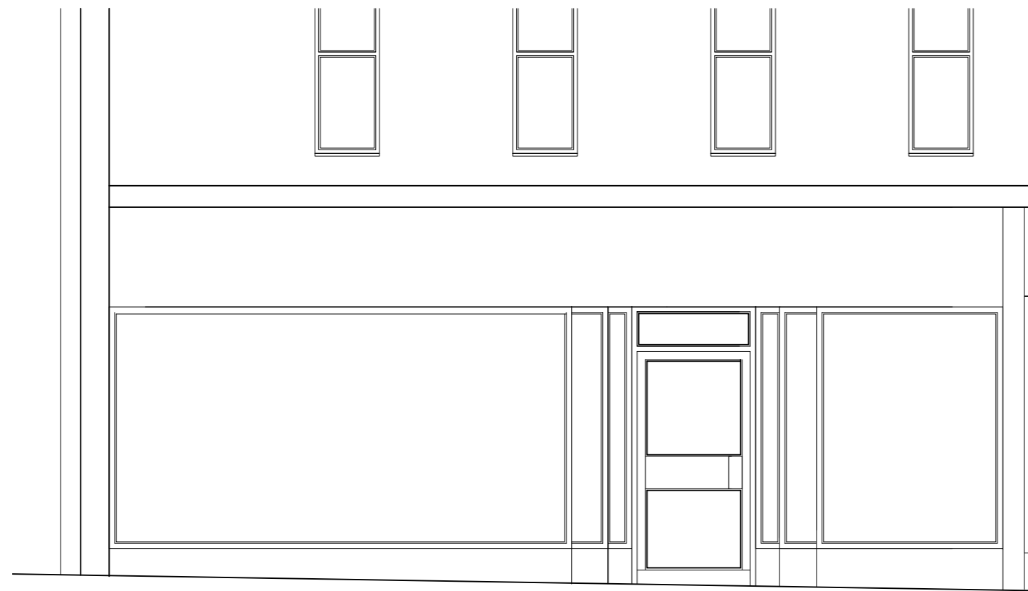
St. John's Street Elevation

ALL DIMENSIONS TO BE CHECKED ON SITE PRIOR TO COMMENCEMENT OF ANY WORK RELATING TO THESE DRAWINGS. FIGURED DIMENSIONS SHOULD TAKE PREFERENCE OVER SCALED. ACCURATE DIMENSIONS REQUIRED SHOULD NOT BE SCALED FROM A PDF COPY OR SHOULD REFER TO SPECIFIC FIGURED DIMENSIONS ON THE DRAWING.